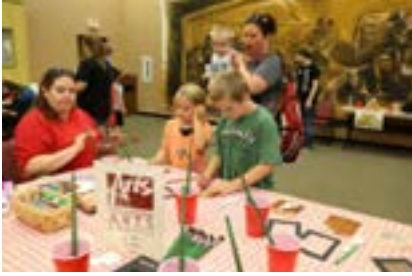
Kids create at the art station, thanks to Oklahoma Arts Council funding!