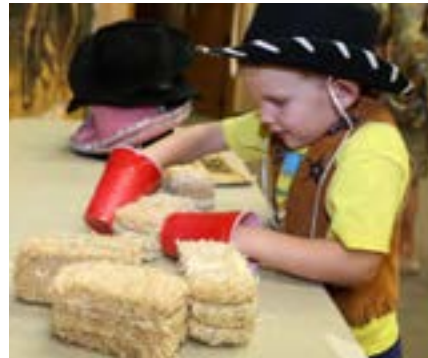
A little buckaroo tries his best to "stack the hay bales" with Red Solo cups!