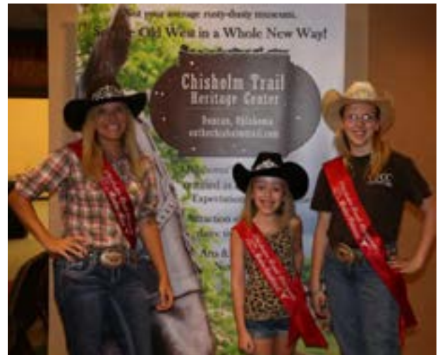
Smiling faces represented the Chisholm Trail Stampedo PRCA Rodeo, helping guests in the theaters.