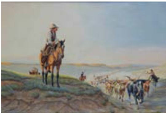
"Blue and His New Bell - Headin' for Dodge" is a 24x36-inch oil painting on canvas.