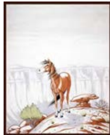
Blue Canyon Horse by Ann Nolan Clark is one of the books in which artist Allan Houser's work was used to help reach Native American children in the 1950s. The book and illustrations will be on display until Aug. 15.

A wickiup and other Apache items will be in the front exhibit room off the main lobby. The interactive field trip includes outdoor animal tracking and Leah has created some interesting visuals for this project.