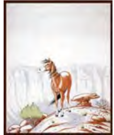
Blue Canyon Horse by Ann Nolan Clark is one of the books in which artist Allan Houser's work was used to help reach Native American children in the 1950s. The book and illustrations will be on display until Aug. 15.

A wickiup and other Apache items will be in the front exhibit room off the main lobby. The interactive field trip includes outdoor animal tracking and Leah has created some interesting visuals for this project.