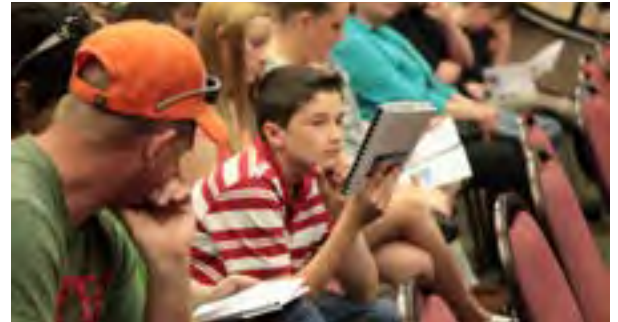
About 40 students and their parents attended the fourth annual creative writing reception on May 4.