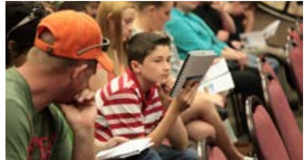
About 40 students and their parents attended the fourth annual creative writing reception on May 4.