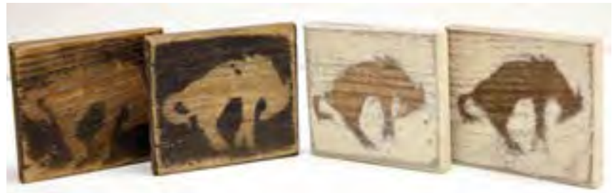
Okie Eclectic handcrafted wood Buffalo and bucking bronc coasters, Mikel Davison originals. Buy 1, or buy a dozen. Great stocking stuffer for the person who thinks they have everything! $2 each

"Wildlife on the King Ranch" is a beautiful pictorial book, 2003, to celebrate the 150th anniversary of the King Ranch. It features the spectacular photography of Tom Urban, who captured everything from the wildlife on the King Ranch to the rich, dramatic landscapes. $40