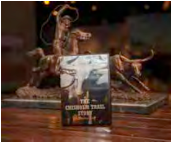
"The Chisholm Trail Story" documentary DVD, running time 18 minutes. $19.95

VISIT THE CHISHOLM TRAIL HERITAGE CENTER'S GIFT SHOP FOR UNIQUE ITEMS