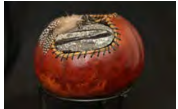
Handcarved, designed gourds by the late Beverly Scott. Variety of sizes and styles: $30.50 to $77. Only a few of these are available.