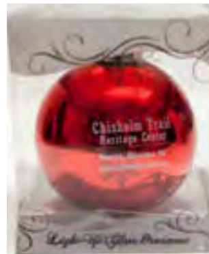
Light up glass ornament "Chisholm Trail Heritage Center" souvenir. $7.95