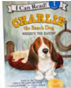
"Charlie the Ranch Dog, Where's the Bacon?" by Ree Drummond - The Pioneer Woman, is an I Can Read, beginner book. Illustrated by Diane deGroat. $16.99