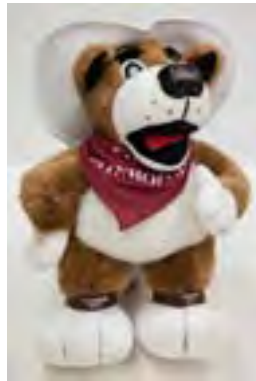
Cody Cowhound is a cuddly Chisholm Trail Heritage Center mascot. $9.00