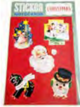
Christmas Sticker Notecards. Once these are gone, they are gone! Unique designs, with a vintage appeal. $3.95 Great stocking stuffer!