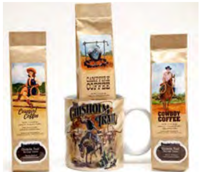
Chisholm Trail and Oklahoma mugs, $5.95 - $11.95 (mug pictured is $7.95) Cowboy Coffee - 3 kinds, Cowgirl Coffee, Cowboy Coffee and Campfire Coffee 1.5 oz - makes 8 -10 cups. $2.76 each. Coffee and cups sold separately.

We can ship items, with additional shipping fees applied. Also, please visit our website to see more gift shop products which you can order.