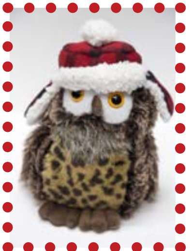
Cuddly owl wearing a red and black plaid 'wool' winter cap will delight boys and girls of all ages. Measures 9-inches tall and six-inches across. Imagine the delight when the littlest family members see it peeking out of a stocking! $13.95