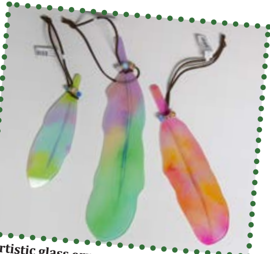
Artistic glass ornament feathers, with leather rope adorned with beads. Three sizes, small 6-inches, $6.95; medium 8-inches, $9.95; large 10.5-inches, $10.95