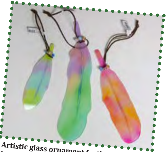
Artistic glass ornament feathers, with leather rope adorned with beads. Three sizes, small 6-inches, $6.95; medium 8-inches, $9.95; large 10.5-inches, $10.95