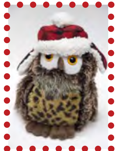
Cuddly owl wearing a red and black plaid 'wool' winter cap will delight boys and girls of all ages. Measures 9-inches tall and six-inches across. Imagine the delight when the littlest family members see it peeking out of a stocking! $13.95