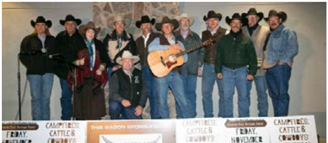
Cold weather didn't deter these poets from the 2nd annual Campfires, Cattle & Cowboys Gathering in November. Mark your calendars for Nov. 17, 2017!