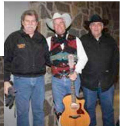
To see more photos, visit: https://www.facebook.com/pg/onthechisholmtrail/photos/?tab=album&album_